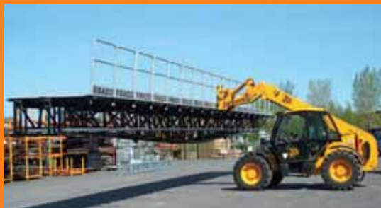
Step 3: remove the 60' bridge