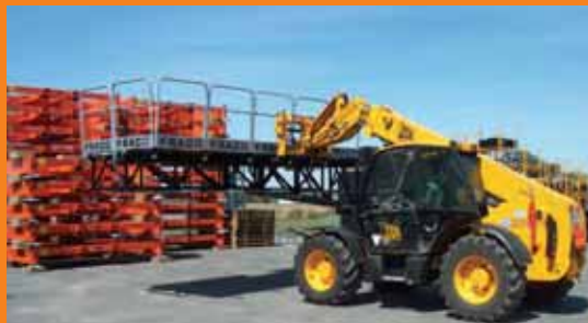
Step 2: remove 20' extensions