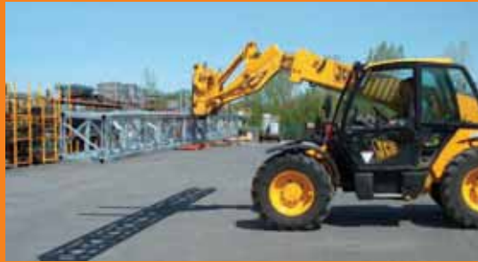
Step 1: remove 30' masts

Here is a good way to save time and money with the FRSM-20K work platform. With the 126' x 45' freestanding set-up, only 2 hours are necessary to move 5 715 ft 2 of workable area from point A to B. This can be done with few picks under regular jobsite conditions by using a 8 000 lbs capacity forklift.