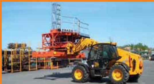
Step 4: relocate both FRSM-20K